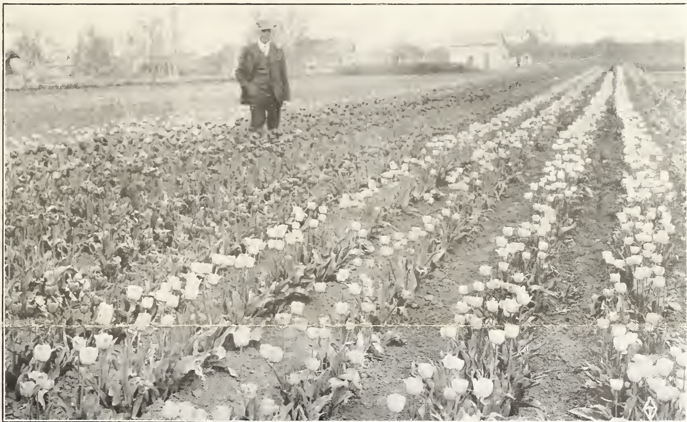
LONG'S GIANT TULIPS, BOULDER, COLORADO, MAY, 1920

Same old story every year, isn't it? In the spring when you promise yourself that NEXT fall you will set out a nice lot of these bulbs. Well, this is "next fall," the time to plant bulbs for early spring flowers. This folder lists the best kinds— LONG'S "Tried and True."